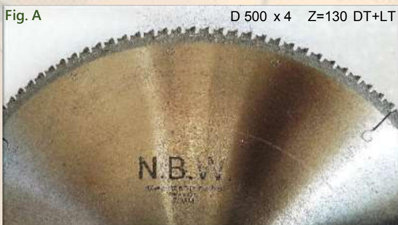
Particolare fig. A Dente con limitatore

The chip limiter gives the blade greater stability and consequently a better finish of the cut piece.